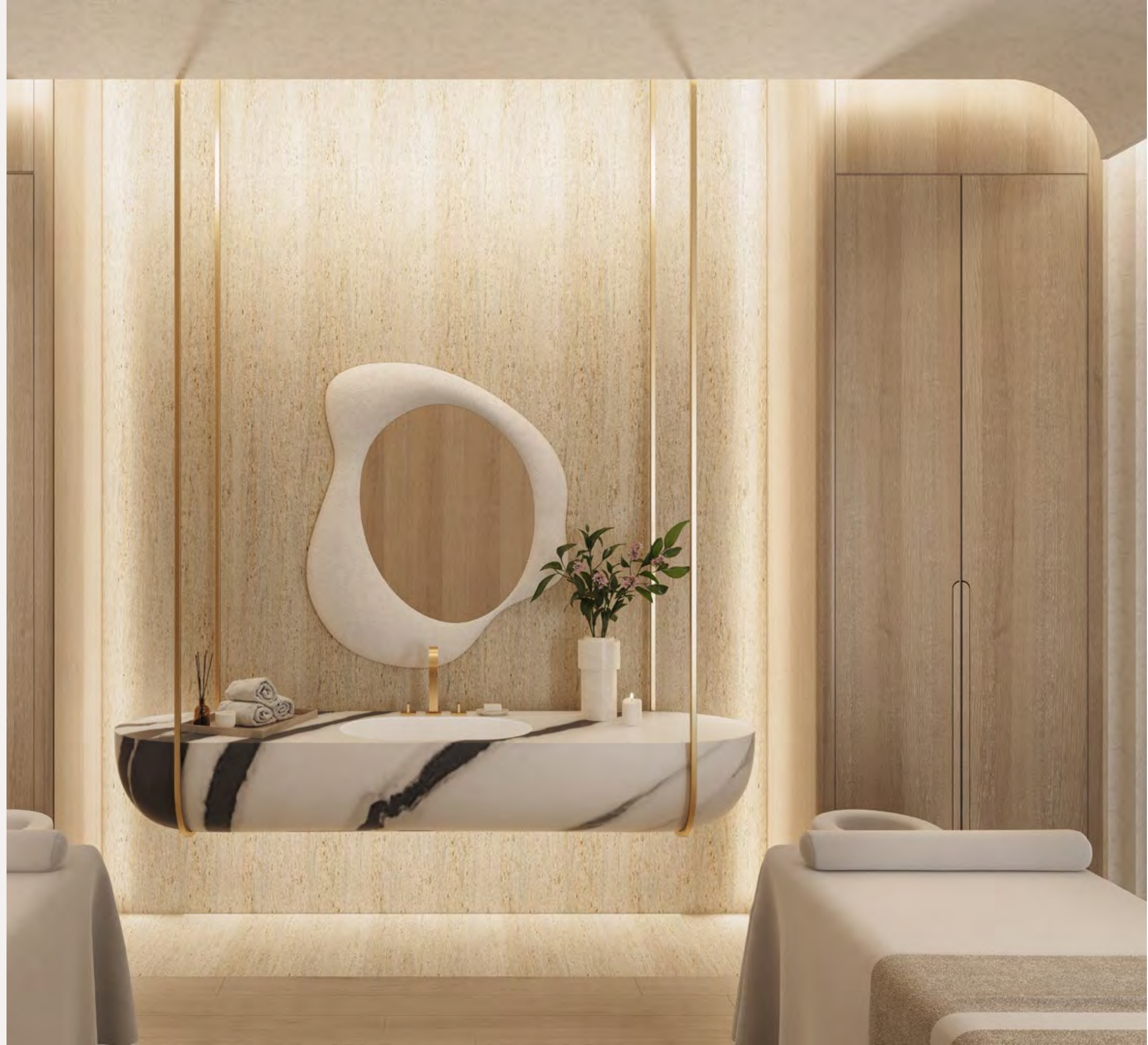
SPA AND TREATMENT ROOM