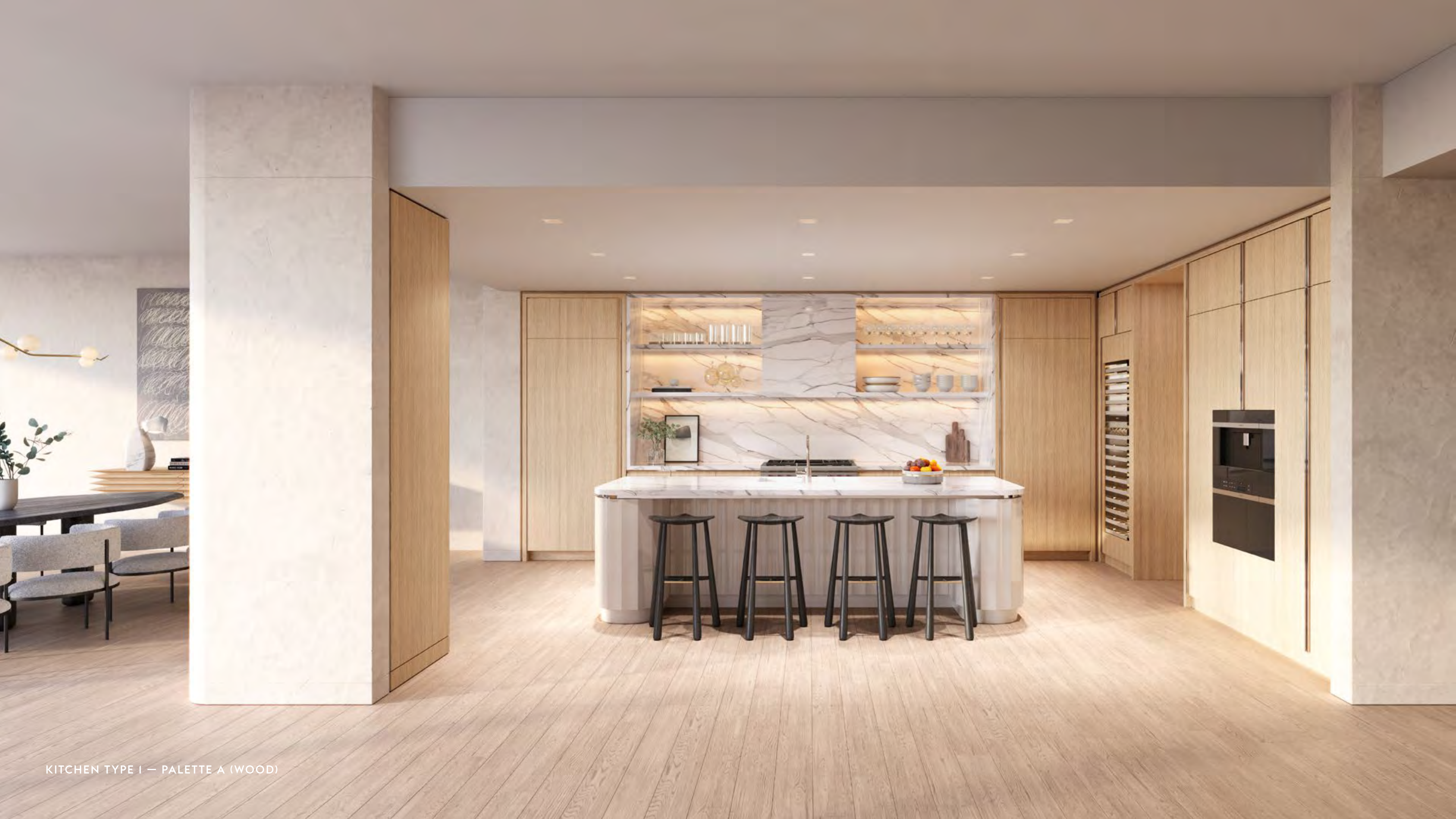
KITCHEN TYPE I — PALETTE A (WOOD)