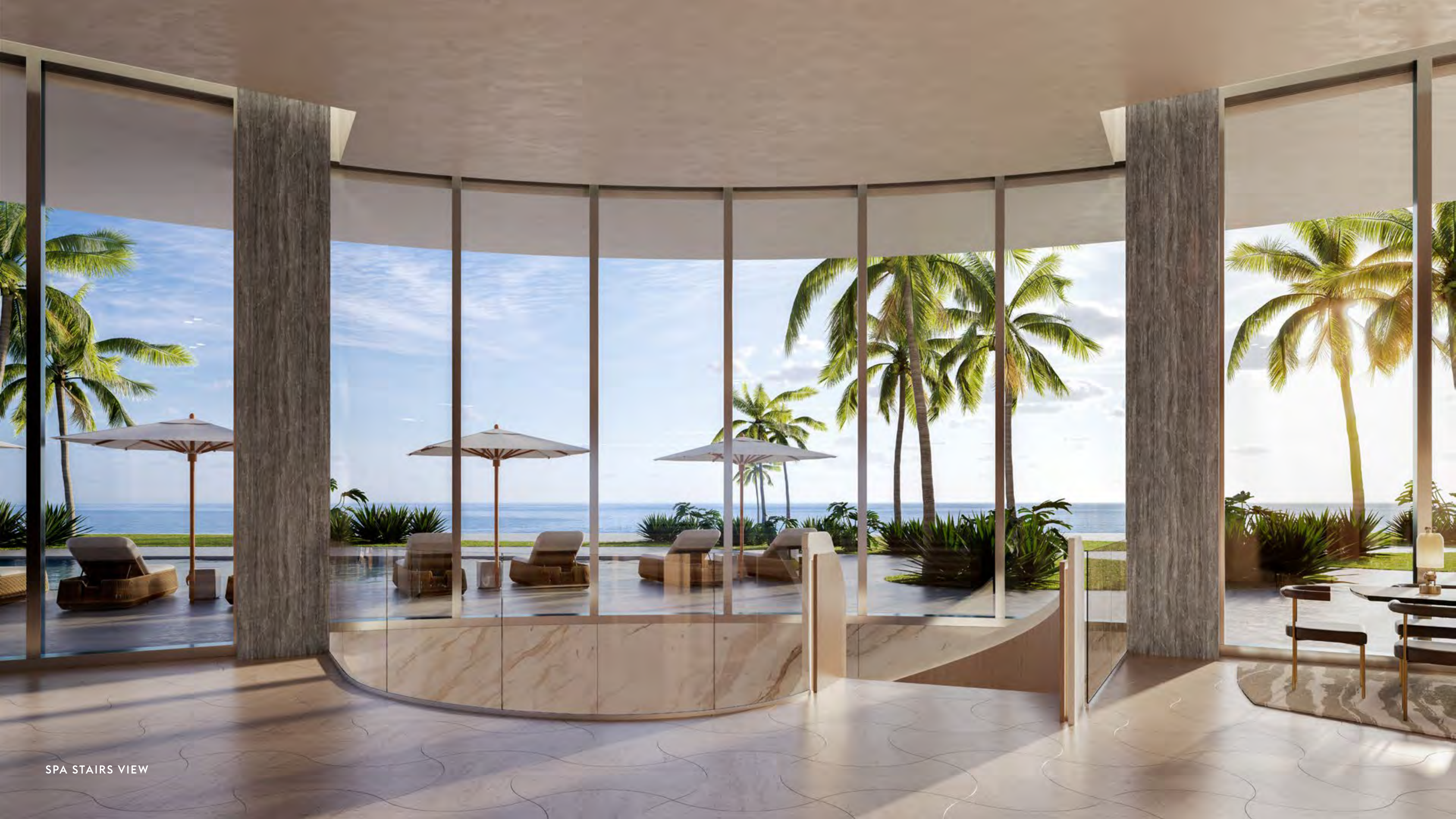
SPA STAIRS VIEW