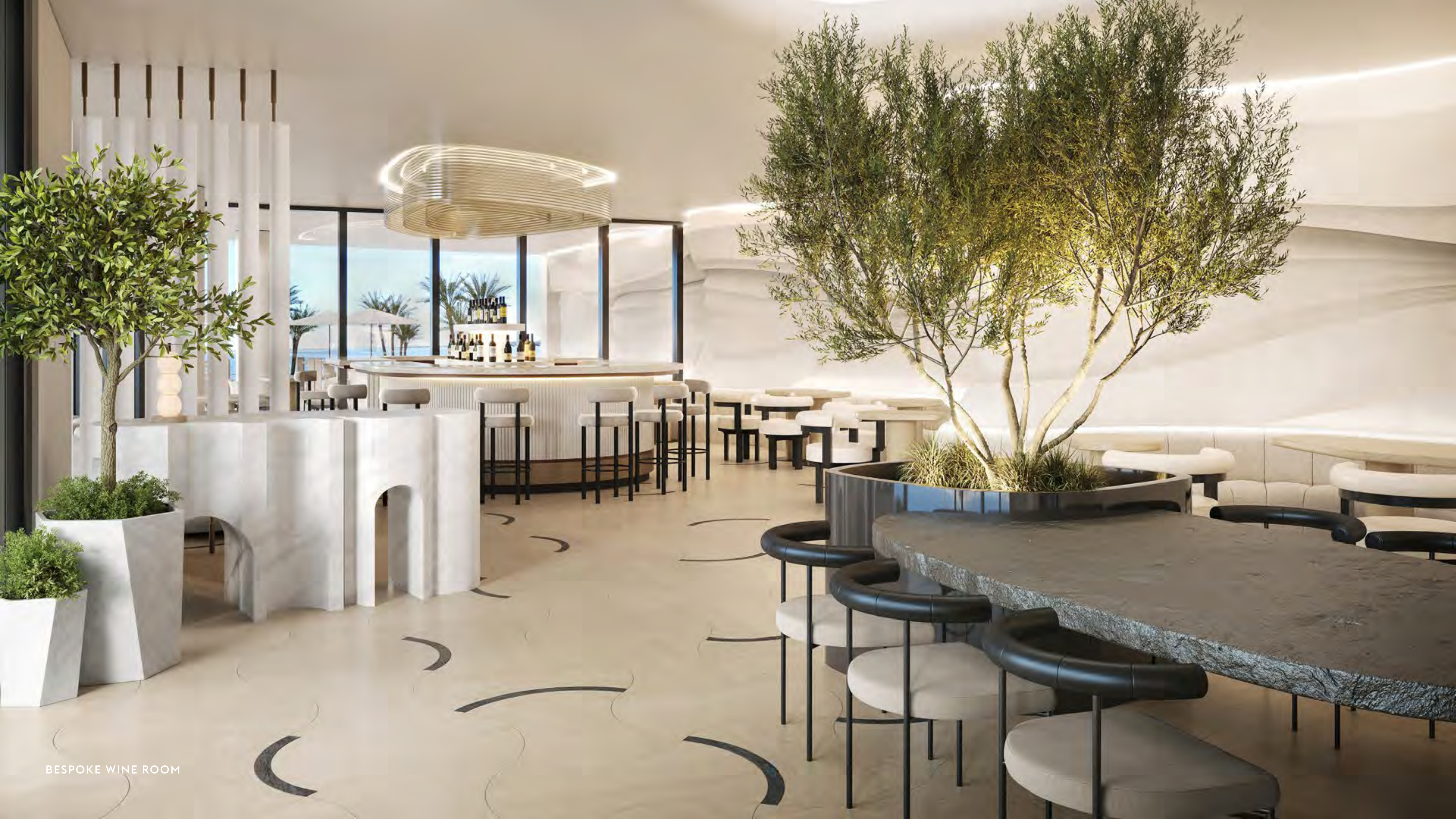
BESPOKE WINE ROOM