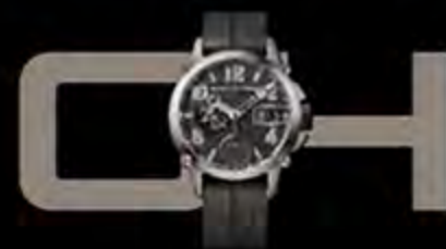
P'6910 Indicator Only chronograph with mechanical digital stopwatch function