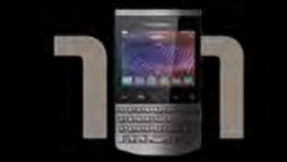
P'9981 Smartphone Porsche Design Smartphone from BlackBerry®