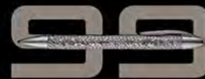
P'3110 Tec Flex Ballpoint Pen Stainless steel weave, borrowed from racing