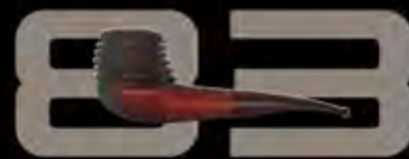
Pipe With machine-milled ribs for thermal cooling effect