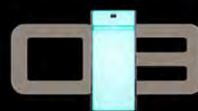
P'3210 Fragrance First fragrance from Porsche Design