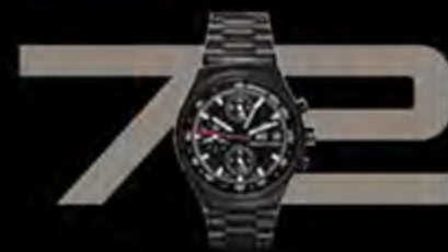
Chronograph I First all-black chronograph

The results are timeless products that have always been ahead of their time – and will continue to be so in the future.