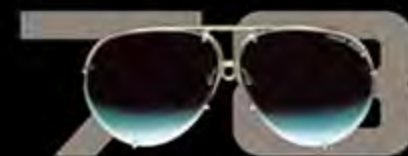
Pilot Glasses First glasses with lens-changing feature