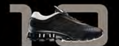
P'5510 Bounce:S 2 With suspension system of metallic springs