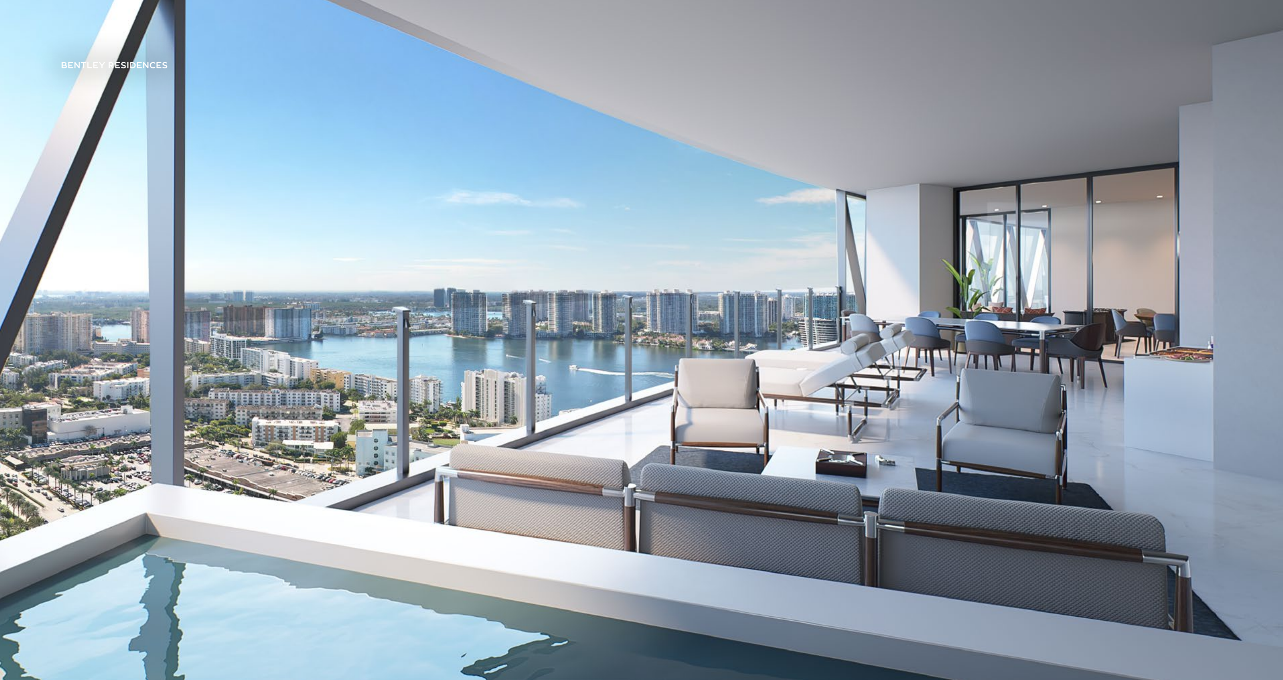
Residence Bentayga Florida Room & Pool