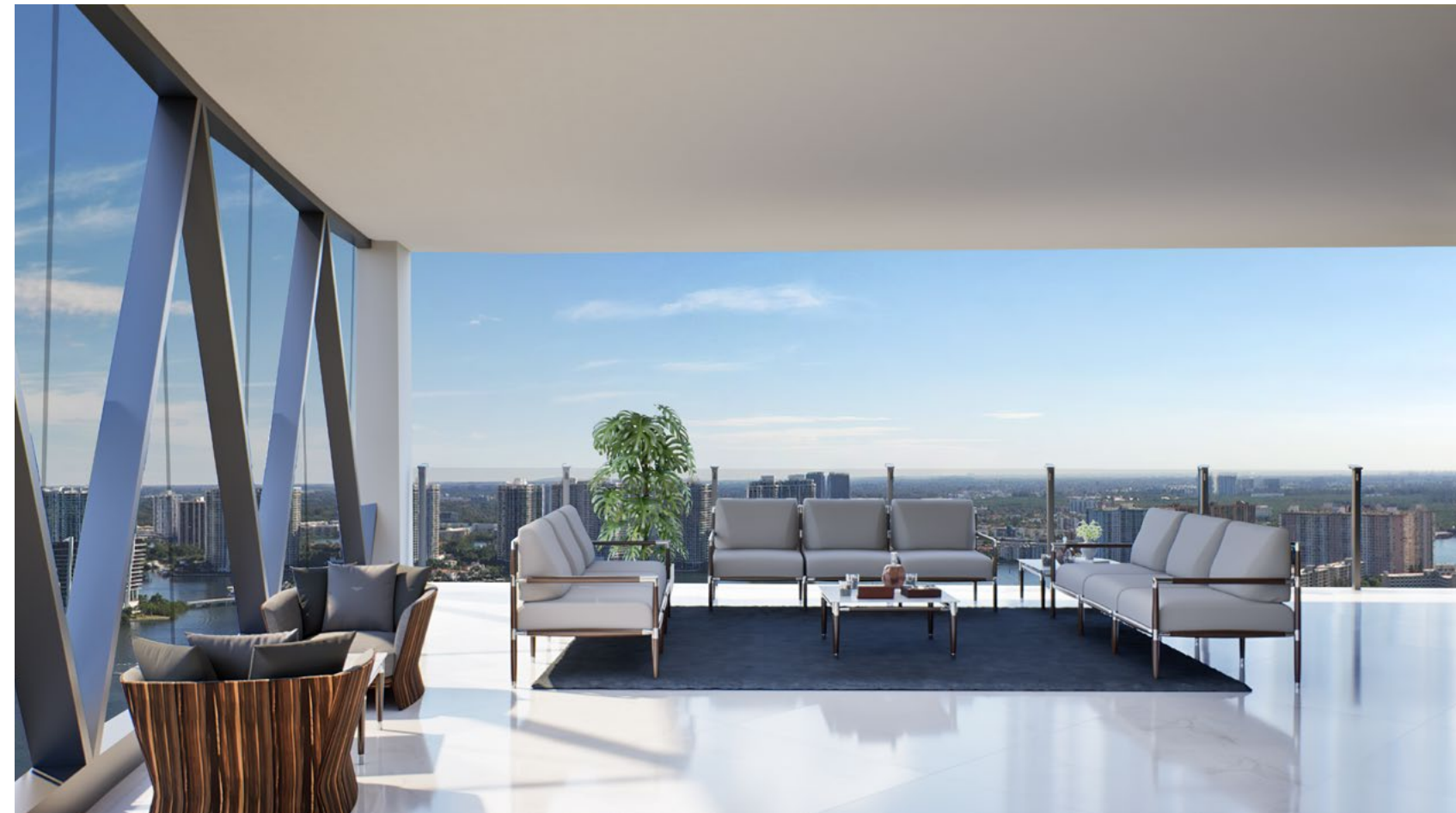
Residence Bentayga Sunset Terrace