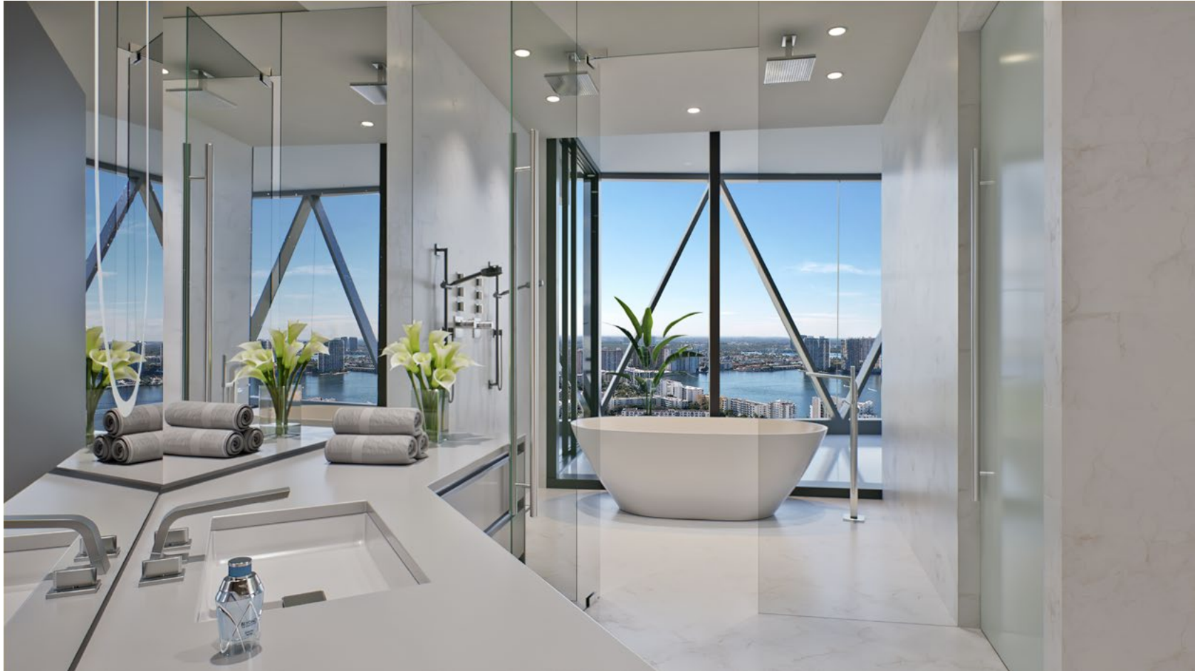
Residence Bentayga Master Bath