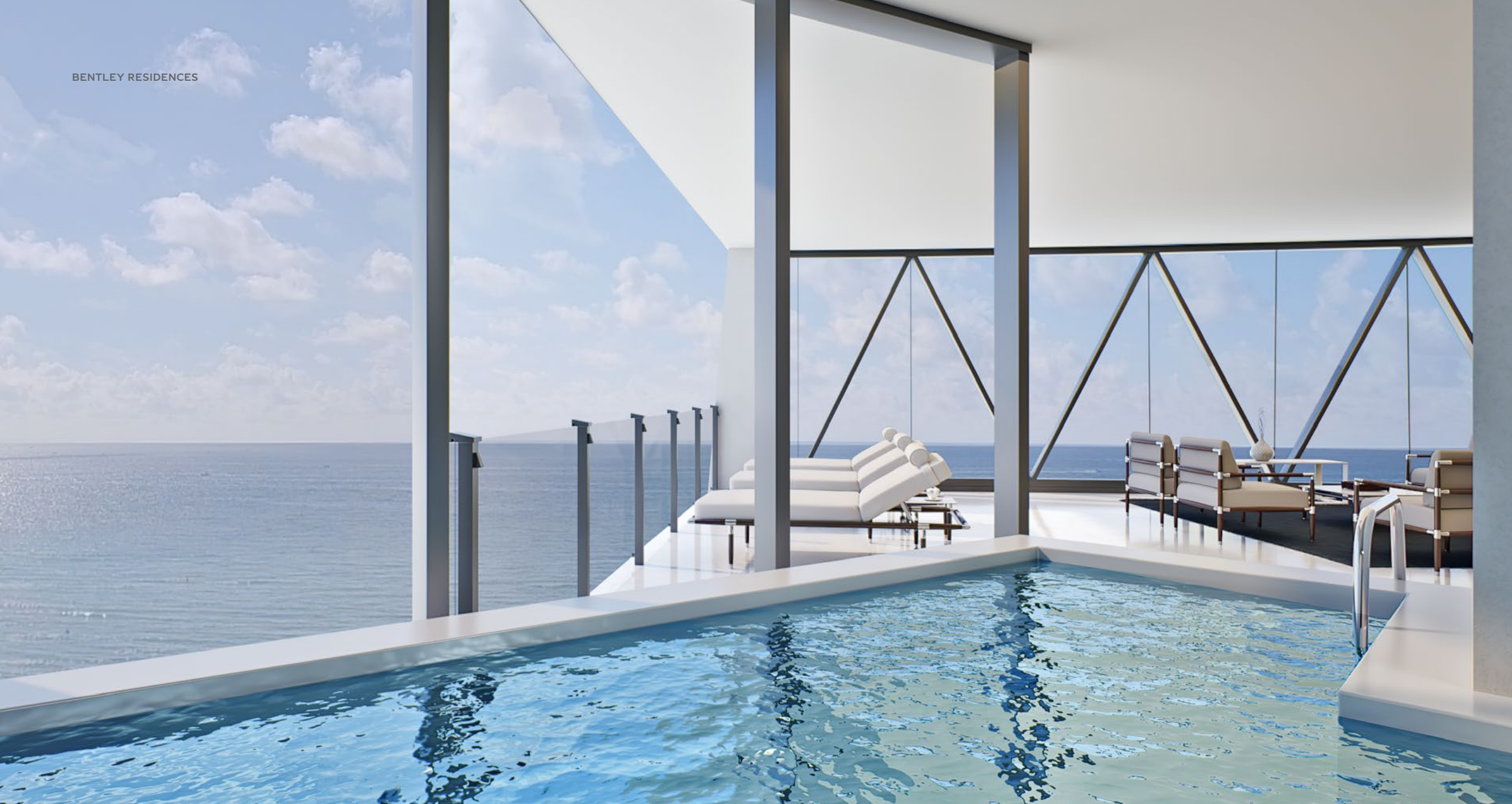
Residence Azure Pool