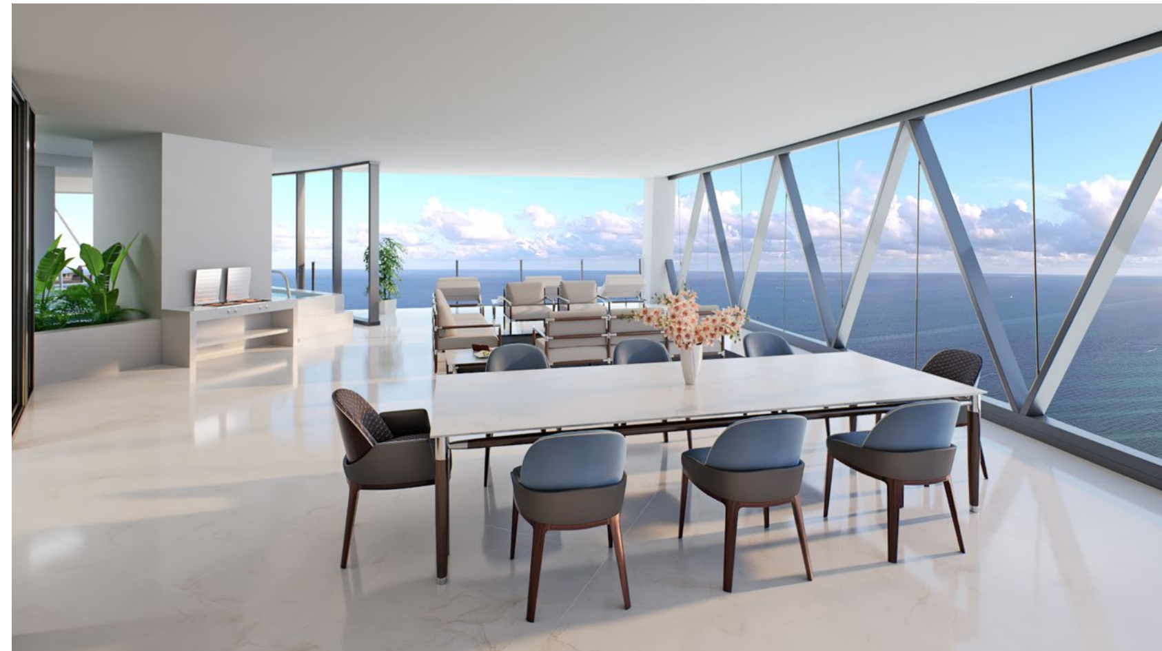
Residence Azure Florida Room