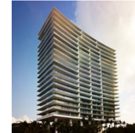
Apogee South Miami Beach