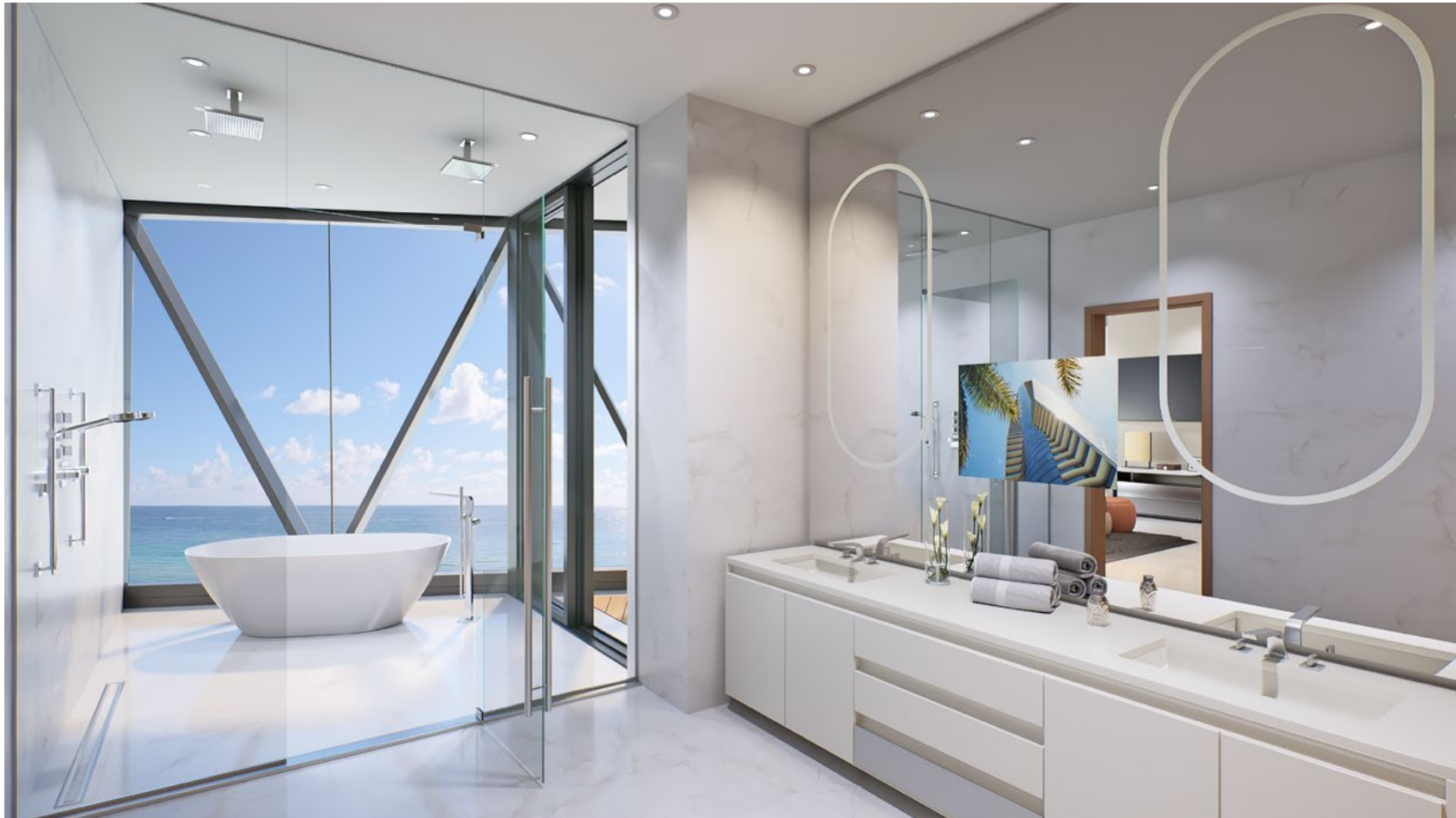
Residence Azure Master Bath