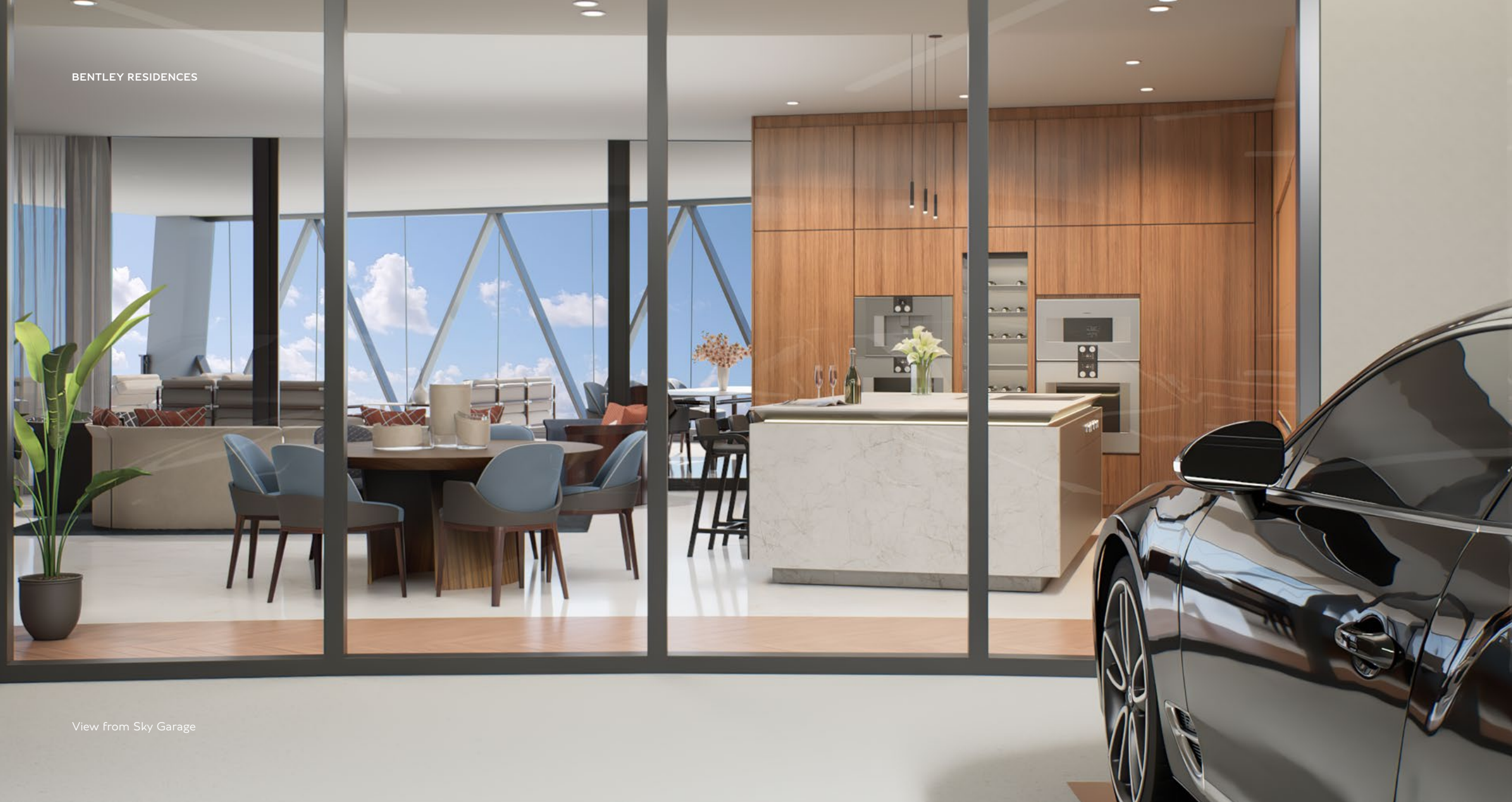
View from Sky Garage