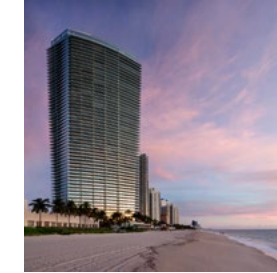
Residences by Armani/Casa