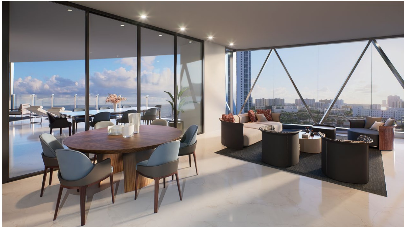
Residence Bentayga Great Room