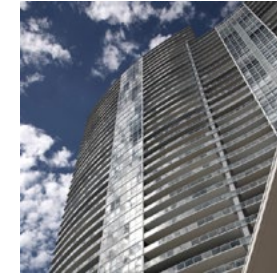
Icon South Miami Beach