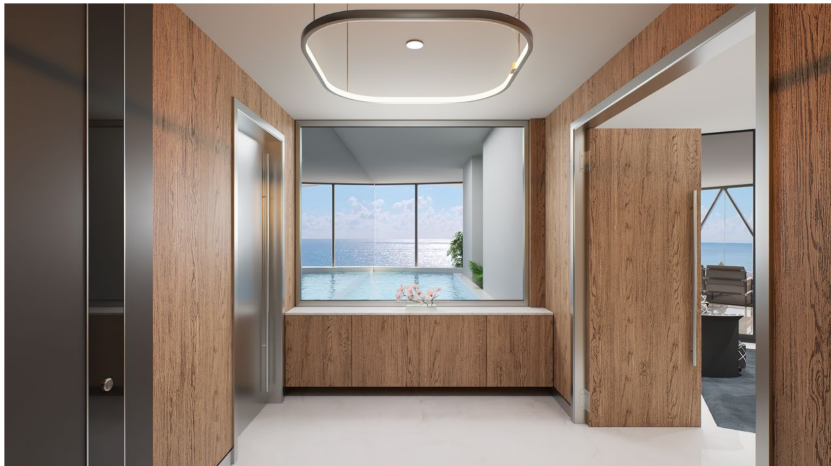
Residence Azure Foyer