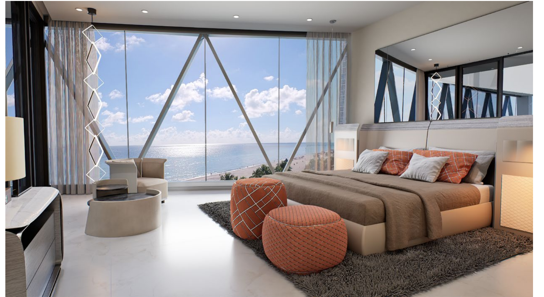
Residence Azure Master Bedroom