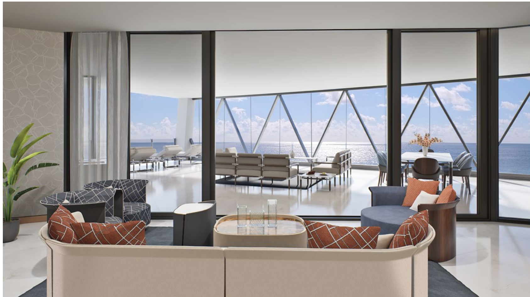
Residence Azure Great Room & Florida Room