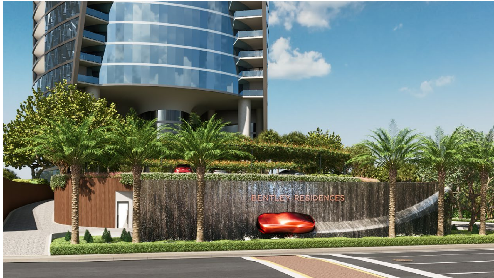
Collins Avenue Entrance