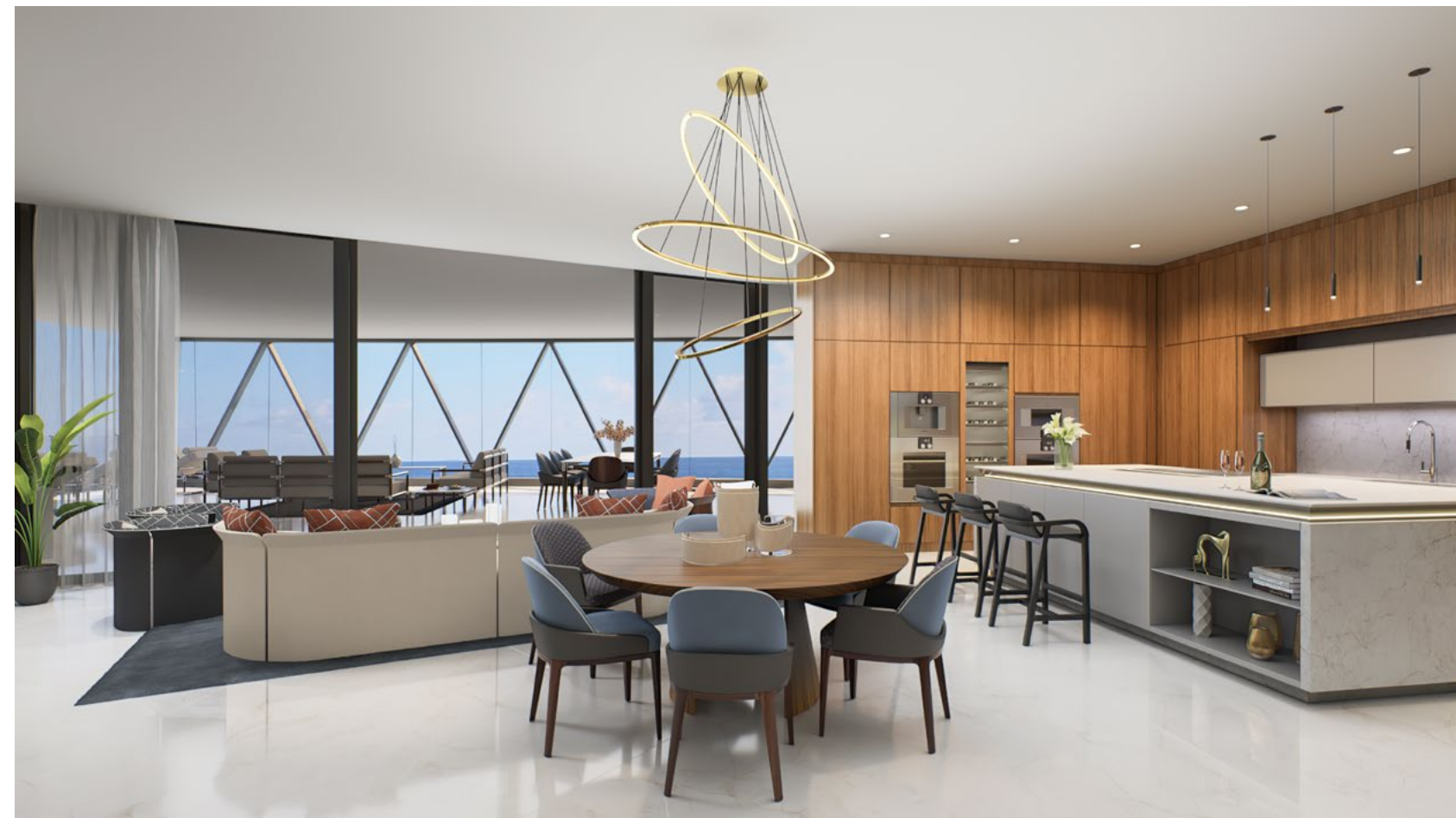
Residence Azure Kitchen