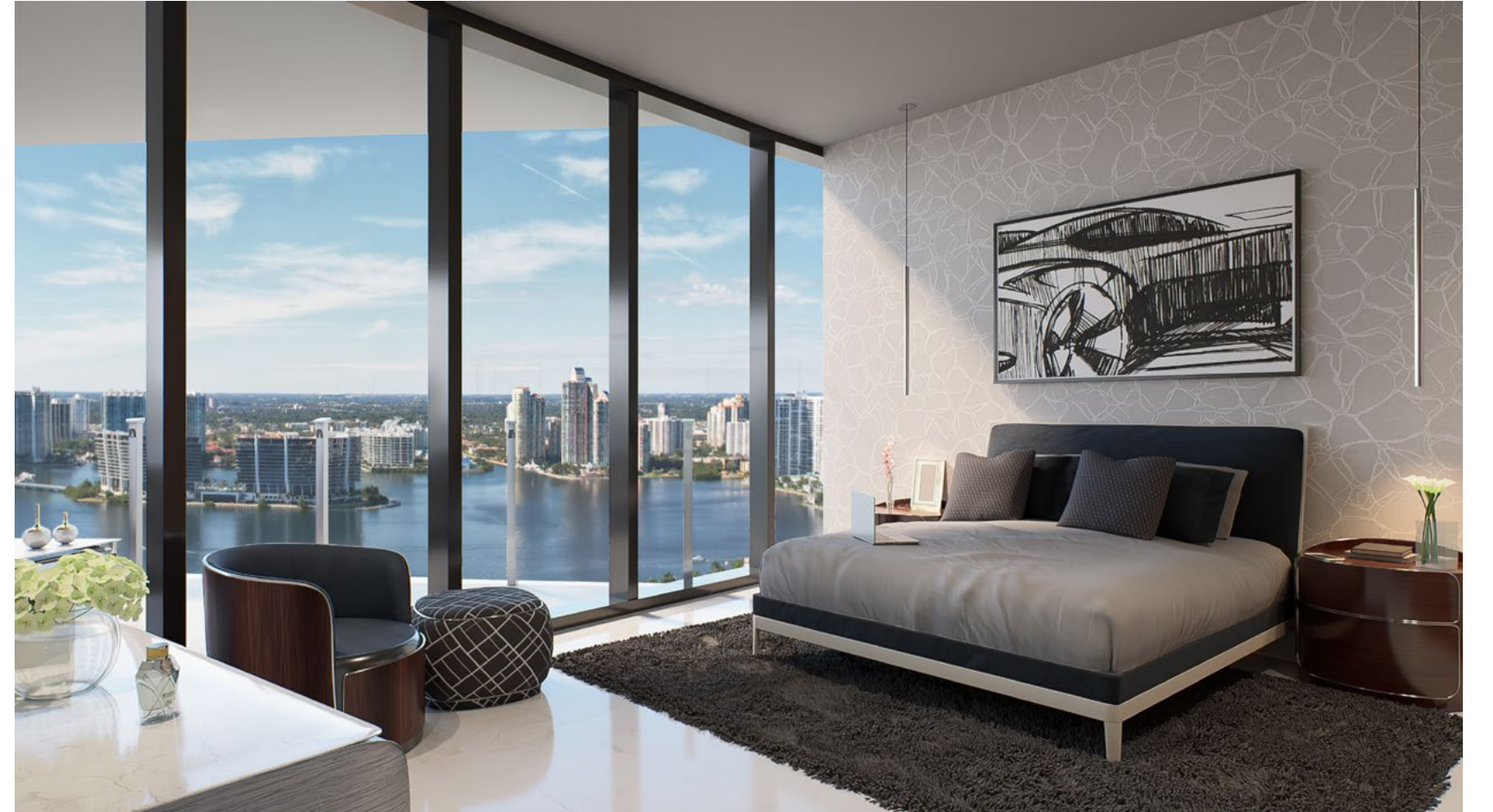
Residence Bentayga Master Bedroom