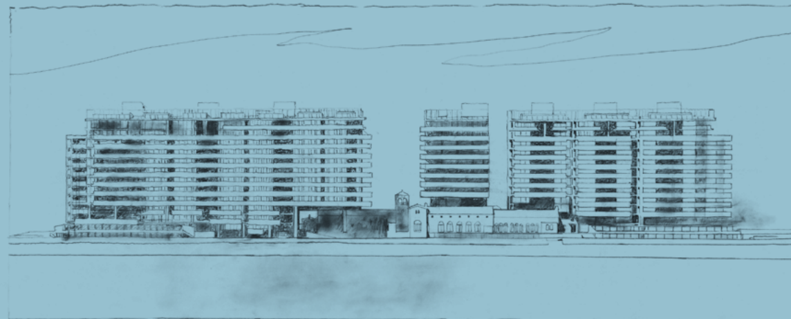
EAST ELEVATION THE SURF CLUB SURFSIDE, FLORIDA Richard Meier 7 JUNE 2013