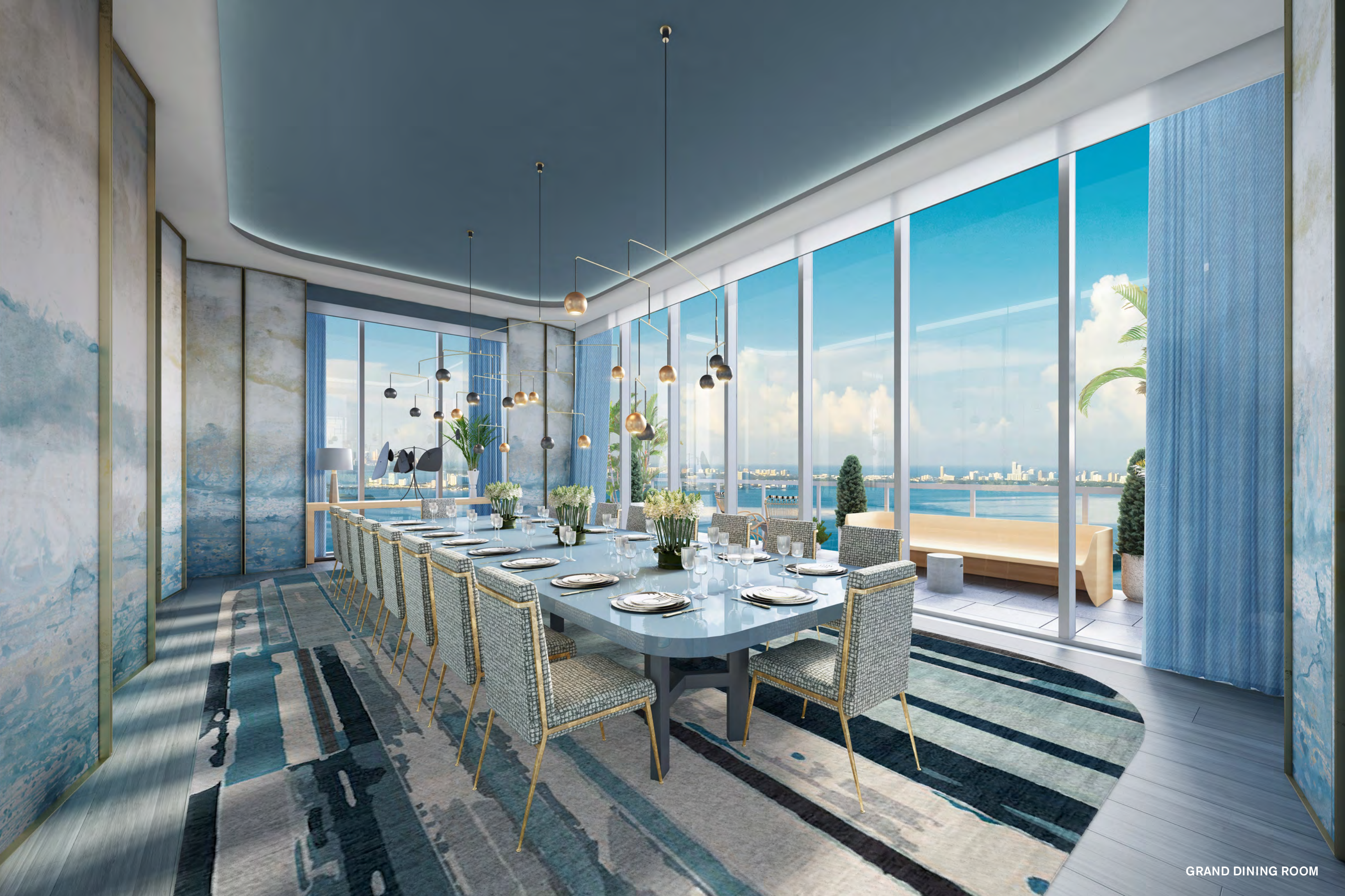
GRAND DINING ROOM