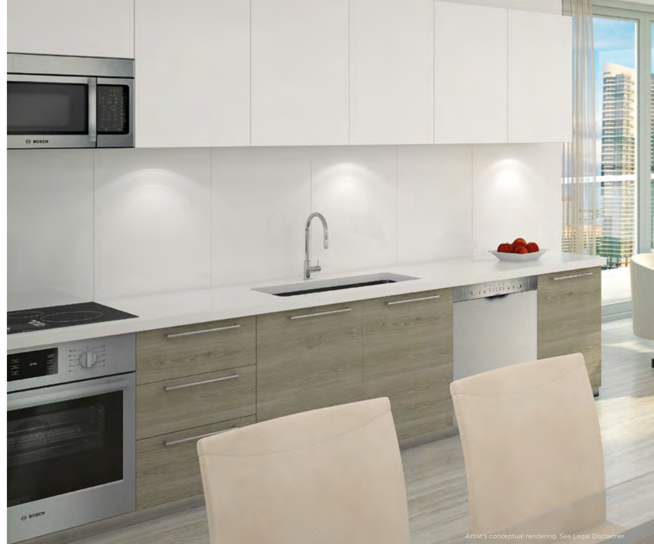
Artist's conceptual rendering. See Legal Disclaimer.