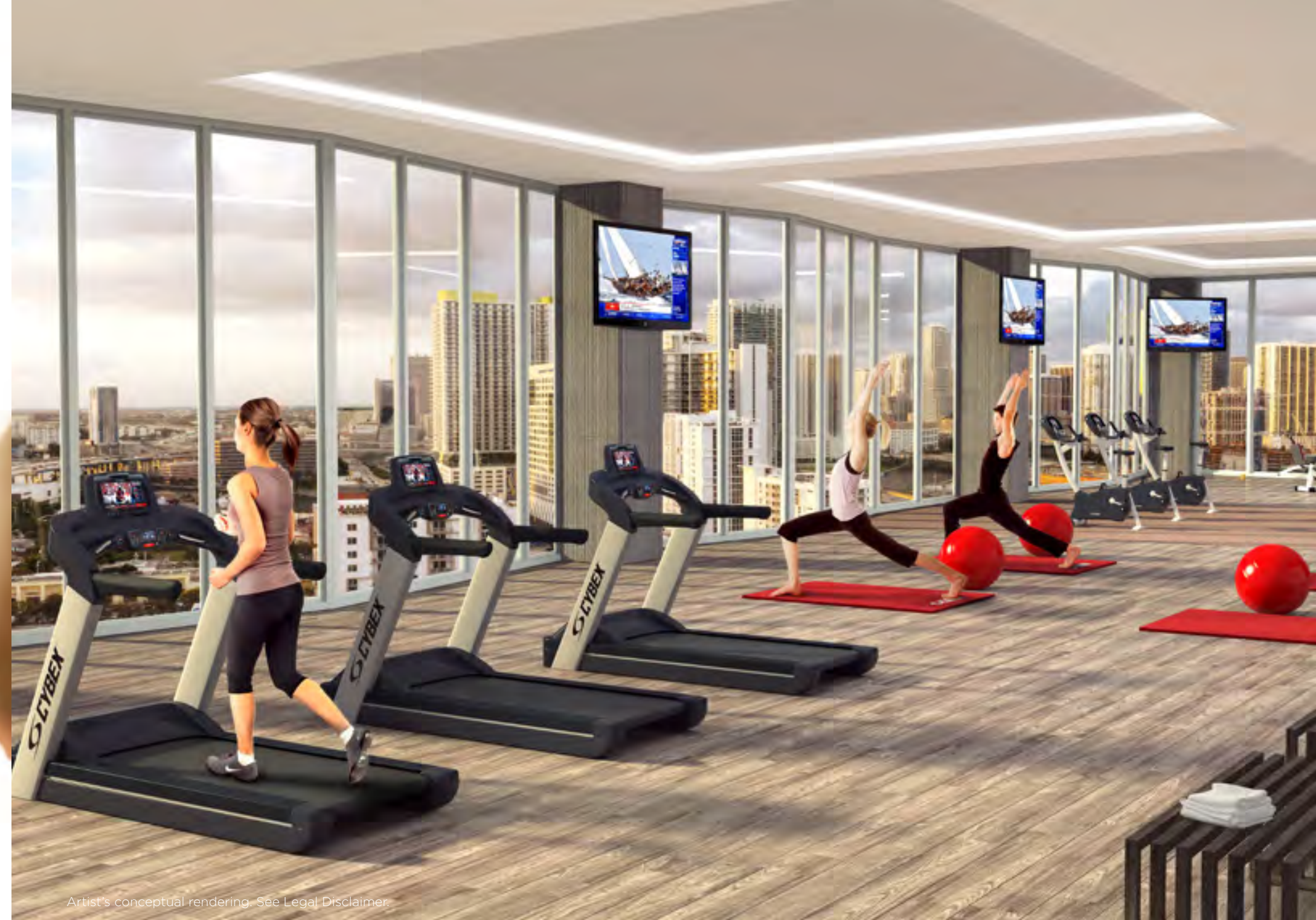
Artist's conceptual rendering. See Legal Disclaimer.

SKYVIEW GYM OVERLOOKING THE MIAMI SKYLINE WITH STATE-OF-THE-ART CARDIO & WEIGHT TRAINING EQUIPMENT