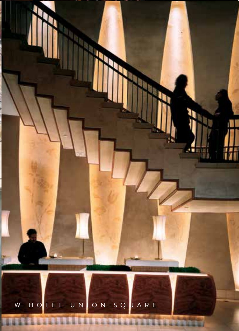
W HOTEL UNION SQUARE