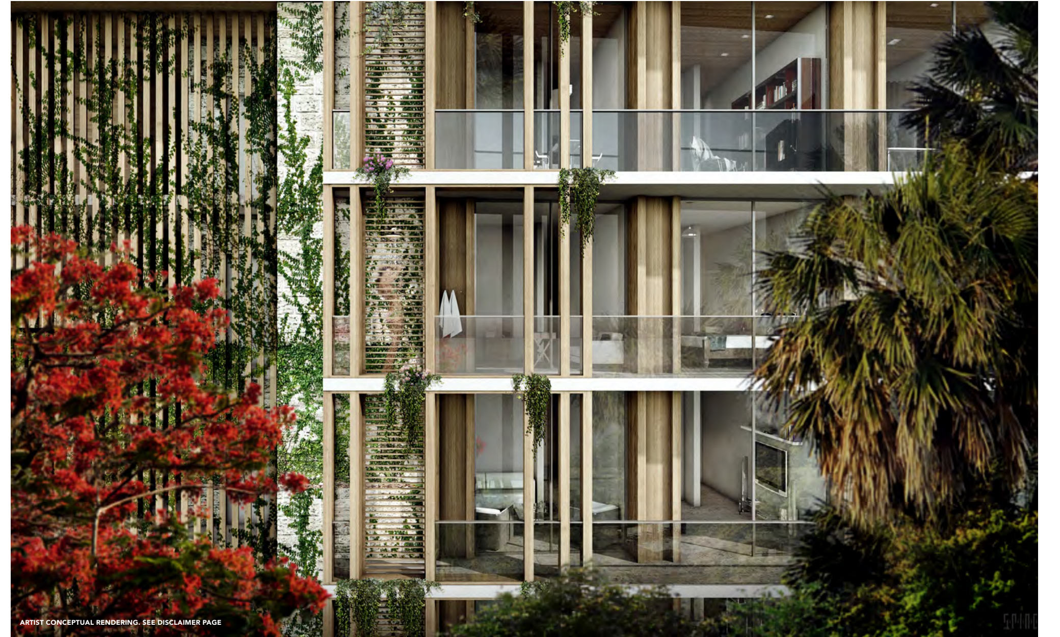
ARTIST CONCEPTUAL RENDERING. SEE DISCLAIMER PAGE