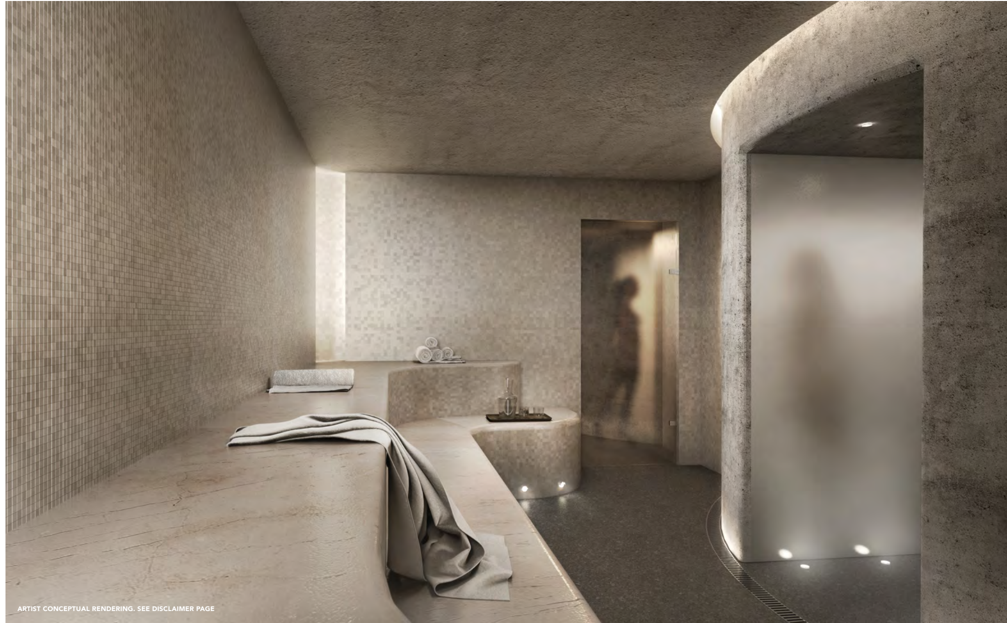
ARTIST CONCEPTUAL RENDERING. SEE DISCLAIMER PAGE