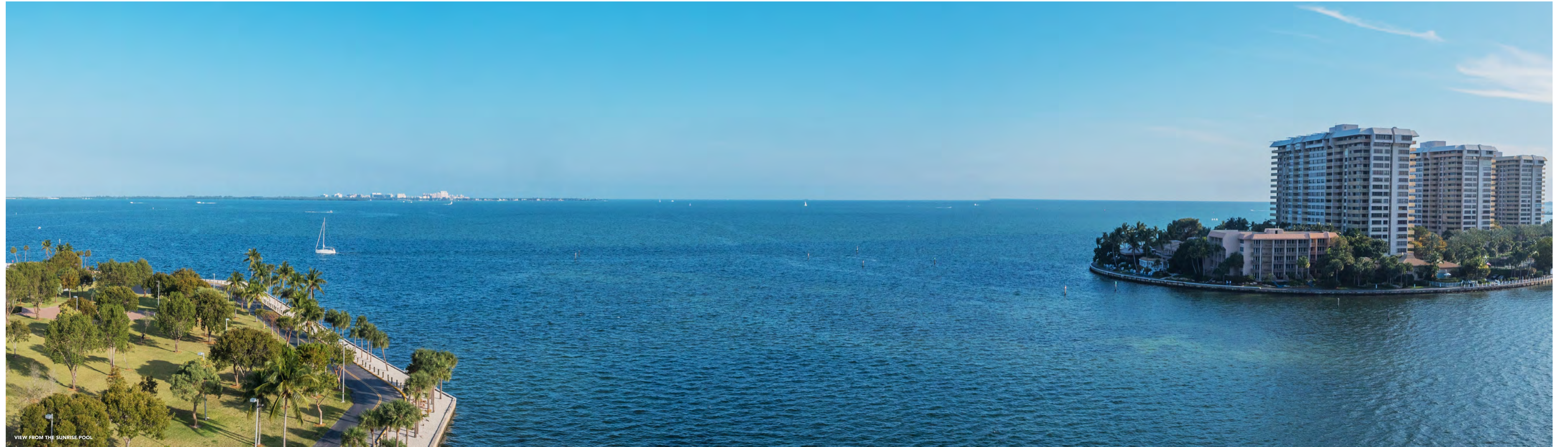
VIEW FROM THE SUNRISE POOL