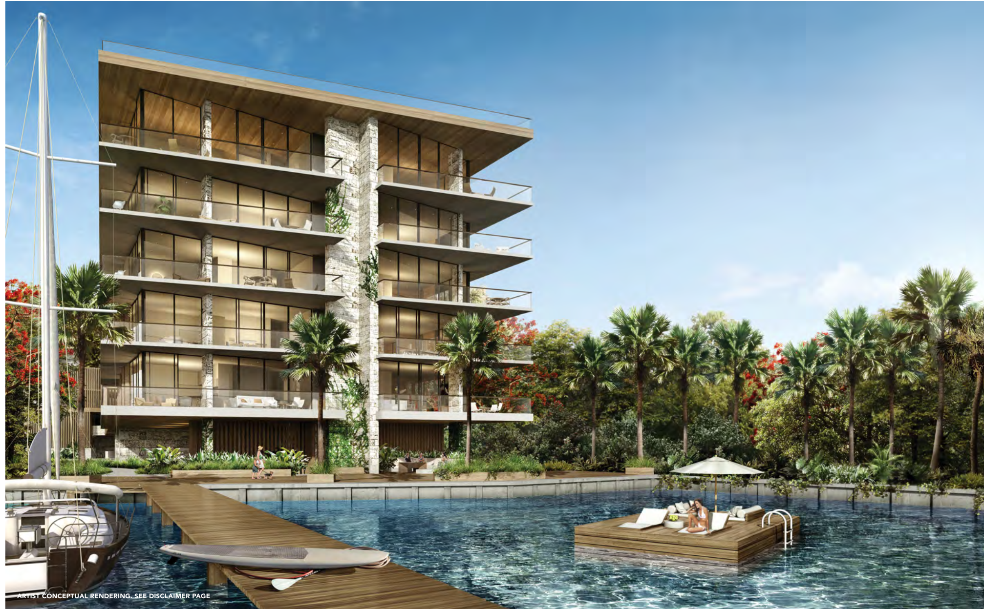
ARTIST CONCEPTUAL RENDERING. SEE DISCLAIMER PAGE