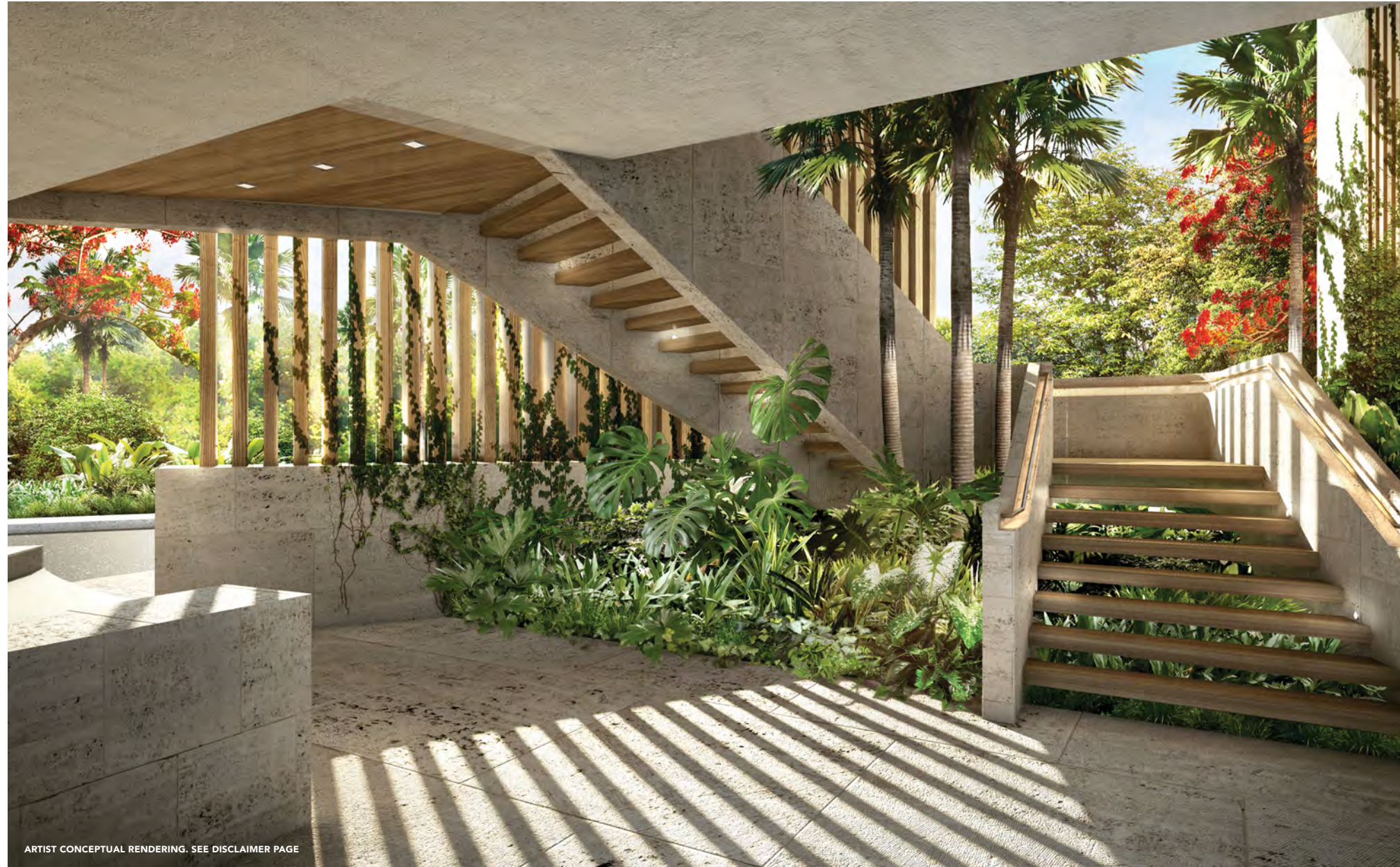
ARTIST CONCEPTUAL RENDERING. SEE DISCLAIMER PAGE